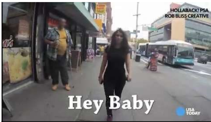
A still shot of "10 Hours of Walking in NYC as a Woman." The video, searchable online, shows a woman dealing with street harassment. It has been viewed nearly 50 million times and has helped raise awareness of catcalling.

Though leaps and bounds have been made for LGBTQ people in the United States in the last decade, and it is important to acknowledge how far we have come, it is also important to acknowledge how much further we have to go.