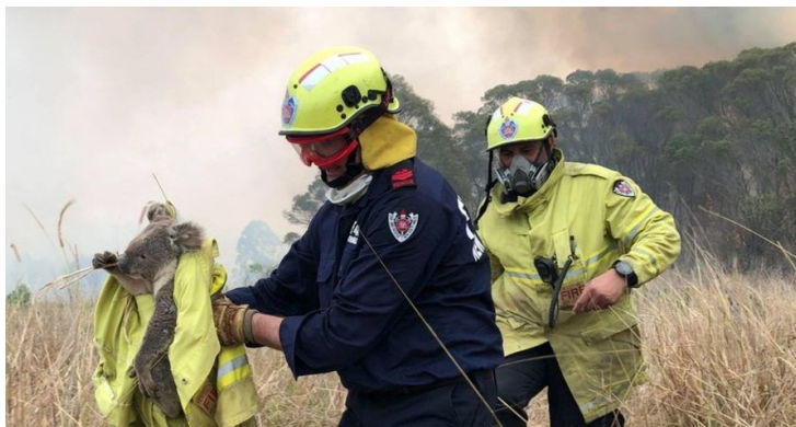
Rescue workers hustle to run an injured koala to safety during the recent wildfires in Australia.

There are many proposed solutions that can help fight climate change: forgoing fossil fuels, funding an infrastruc-