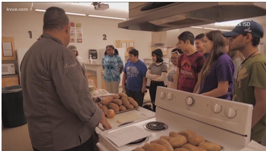
Round Rock (Texas) Independent School District offers "Adulthood" classes to its high school students.

Learning things such as how to cook and prepare food is crucial for moving into adulthood and living on one's own. Home economics is a class taught at some high schools, but it is not taught here at Triton. Home economics teaches the basics of cooking food, food portioning and preparation, and safety and hygiene. Learning more about these skills